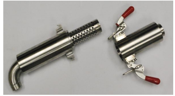
Figure 3: Insert the Filter Paper into the Perforated Cylinder