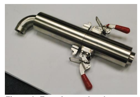
Figure 2: Easy Access Latches